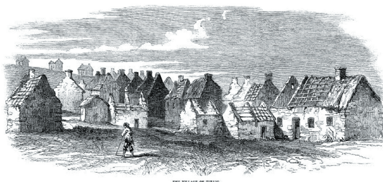
The village of Tullig, Illustrated London News , 15 December 1849