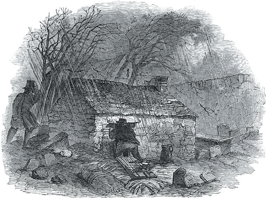
THE HUT OR WATCH-HOUSE IN THE OLD CHAPEL YARD.

In July 1847, the parish priest of Kilglass, County Roscommon, wrote a letter to the editor of The Freeman , saying that his parishioners were dying fast of fever: