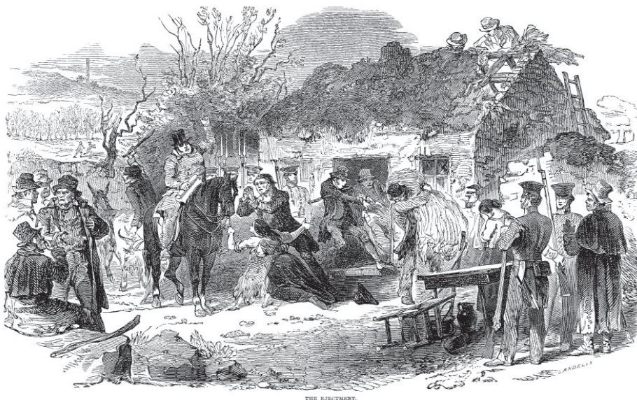
The ejectment, Illustrated London News , 16 December 1848

A correspondent of the Limerick and Clare Examiner reporting on evictions claimed that not only were the bad landlords “going to the extremities of cruelty and tyranny”, but even the good ones were “going to the bad.” However, he also noted that they are both “suffered by a truckling and heartless government to make a wilderness of the country and a waste of human life.” 106 These examples of media opinion indicate that, even though landlords were seen as the immediate culprits, the government could not be vindicated – both were to blame for the terrible consequences of mass evictions. The Tipperary Vindicator delivered a thundering indictment implicating both: