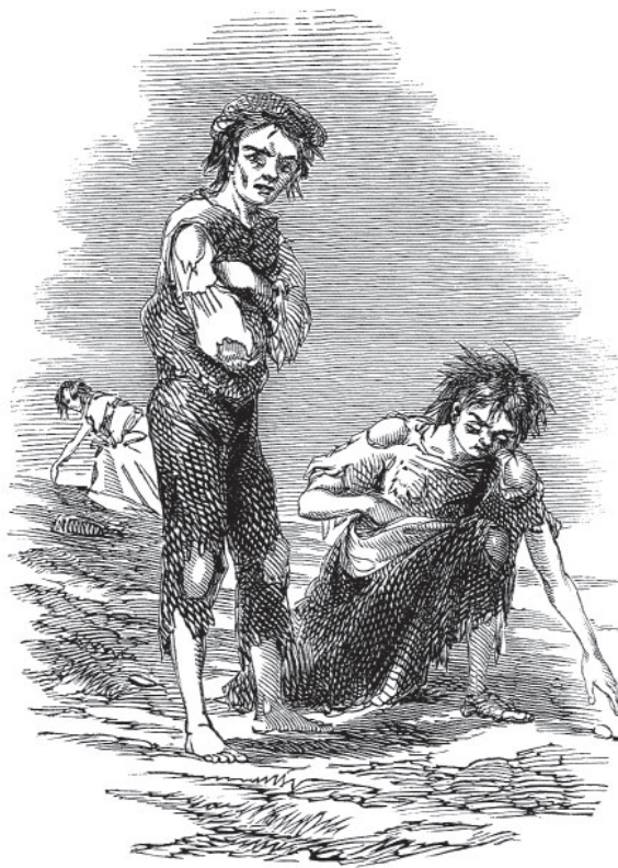
BOY AND GIRL AT CAHERA.

winter of 1847. 51 This suggests that the sight of “famishing crows” in blighted fields was neither unusual nor confined to a single locality. In January 1847, the British Relief Association appointed Count Strzelecki as agent for counties Donegal, Mayo and Sligo. 52 Having arrived at Westport, he reported to the Association: