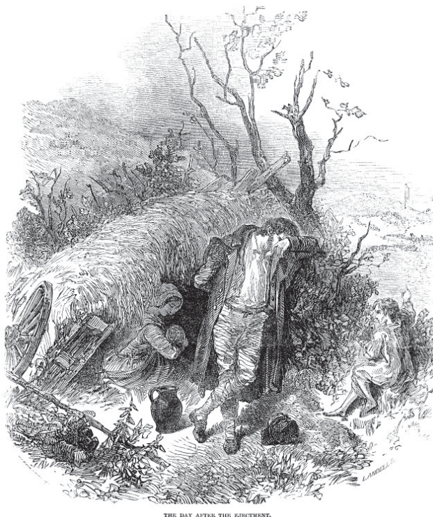
Scalpeen of an evicted family. Illustrated London News , 16 December 1848.